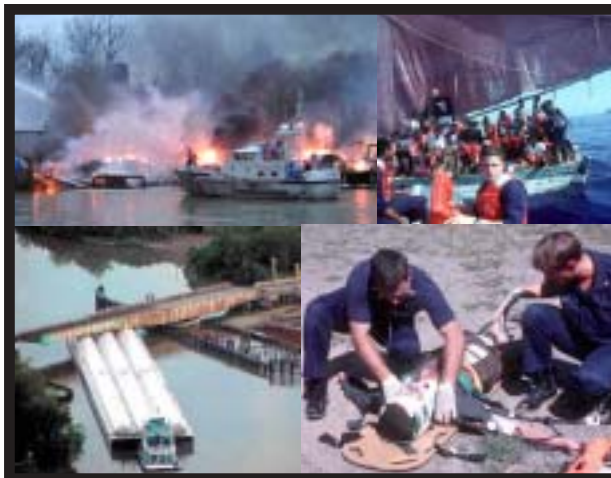
Emergency Management is needed as disasters come in all shapes and sizes, from fires to bridge collapses, single persons injuries to hundreds at sea!

Interactive Voice Response (IVR) 1 (888) 336-3260 Available around the clock Monday - Saturday