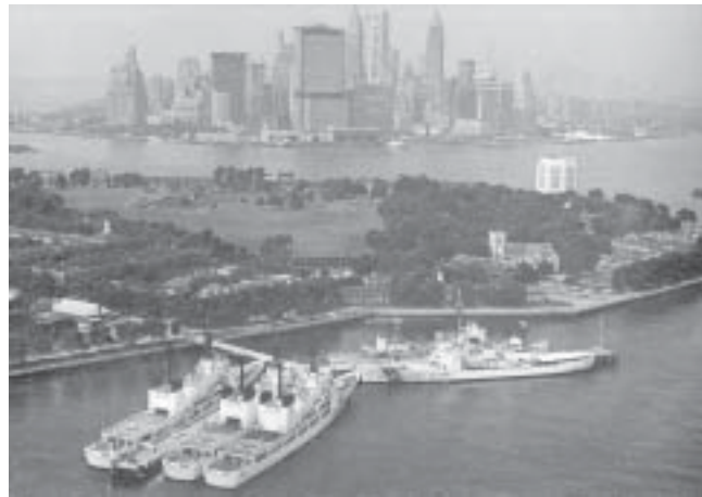
At its peak, Governors Island was the largest command in the USCG, home to over 5,000 sailors and a dozen units. It is arguably some of the most valuable and beautiful real estate in the nation.

Just before leaving office, Clinton granted national monument status to two forts on the island. The Justice Department later said existing law stipulating that the island be sold overrode Clinton's declaration.