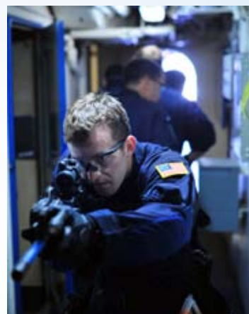
Modern Cuttermen from Maritime Safety and Security Team Honolulu clearing spaces aboard the USS Ogden (LPD-5).

Before the war, the revenue cutter fleet served primarily as a maritime police force, enforcing U.S. trade laws and tariffs, and interdicting maritime smuggling. However, the War of 1812 solidified the cutters' naval role and new wartime missions, including high seas combat, port and coastal security, reconnaissance, commerce protection and shallow-water combat operations.