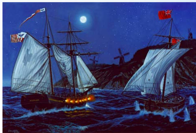
Captain John Cahoon's crew on board the cutter Vigilant open fire on the British privateer Dart on the east end of Block Island, off the coast of Rhode Island in October 1813. The Dart had captured more than 20 American merchantmen. Cuttermen eventually board the privateer in what is described as "one of the most impressive captures of an enemy ship by a revenue cutter" and "the last known use of an armed boarding party by a revenue cutter during the Age of Sail."

News of the privateer arrived in Newport on