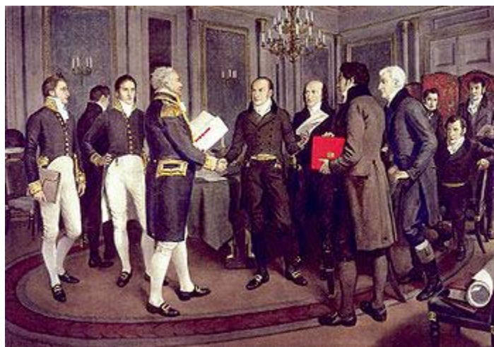
The Treaty of Ghent (8 Stat. 218), signed on 24 December 1814, in Ghent (modern-day Belgium), was the peace treaty that ended the War of 1812 between the United States and Great Britain. The treaty largely restored relations between the two nations to status quo ante bellum, with no loss of territory either way. Because of the era's slow communications it took weeks for news of the peace treaty to reach the United States; the Battle of New Orleans was fought after it was signed. However the treaty was not in effect until it was ratified by both sides in February, 1815, a month after the battle ended.